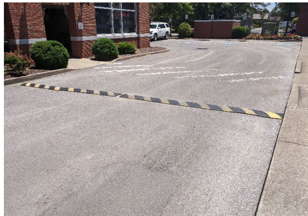
Speed bumps are not an approved traffic calming technique for residential streets.

Speed Bumps are shorter (six to 12 inches long) than speed humps (12-22 feet) and have been associated with maintenance, safety, and liability concerns. Speed “bumps” are not allowed in the City as a traffic calming device on residential streets.