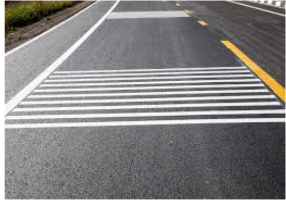
Rumble strips may not be used as a traffic calming technique.

Rumble strips are raised buttons, bars, or groves that are closely placed on a roadway at regular intervals. They cause both noise and vibration in vehicles as motorists drive over them. Typically, rumble strips are used to alert motorists of unusual conditions ahead. As motorists get used to the rumble strips, the strips become less effective over time. Rumble strips can result in increased noise levels for nearby residents. Also, rumble strips require a high amount of maintenance. For these reasons, rumble strips may not be used as a traffic calming technique in the City of Calera.