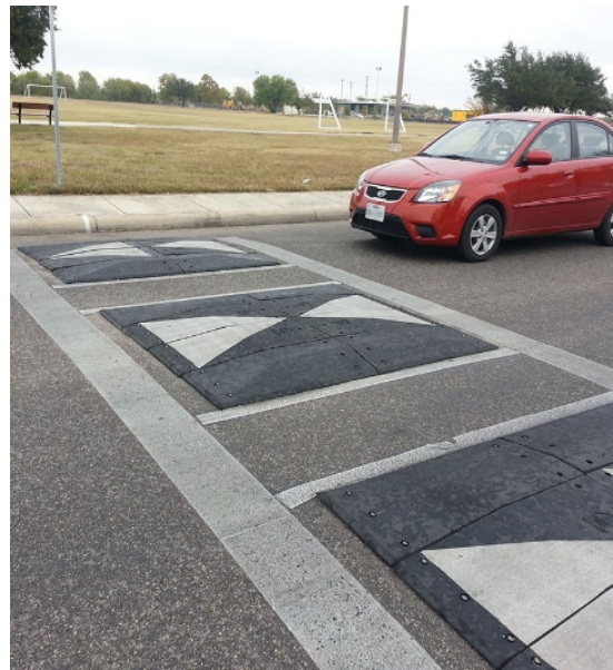
EXAMPLE: Speed cushions that may be permitted in the City of Calera.

A speed cushion is a series of small rubber speed cushions installed across the road. Designed to be wide enough to slow cars while narrow enough for emergency vehicles to straddle. Speed "bumps" are not allowed in the City as a traffic calming device. Speed Cushions will not be permitted on any Minor Collector Roadways that are included in the Neighborhood Traffic Calming Program.